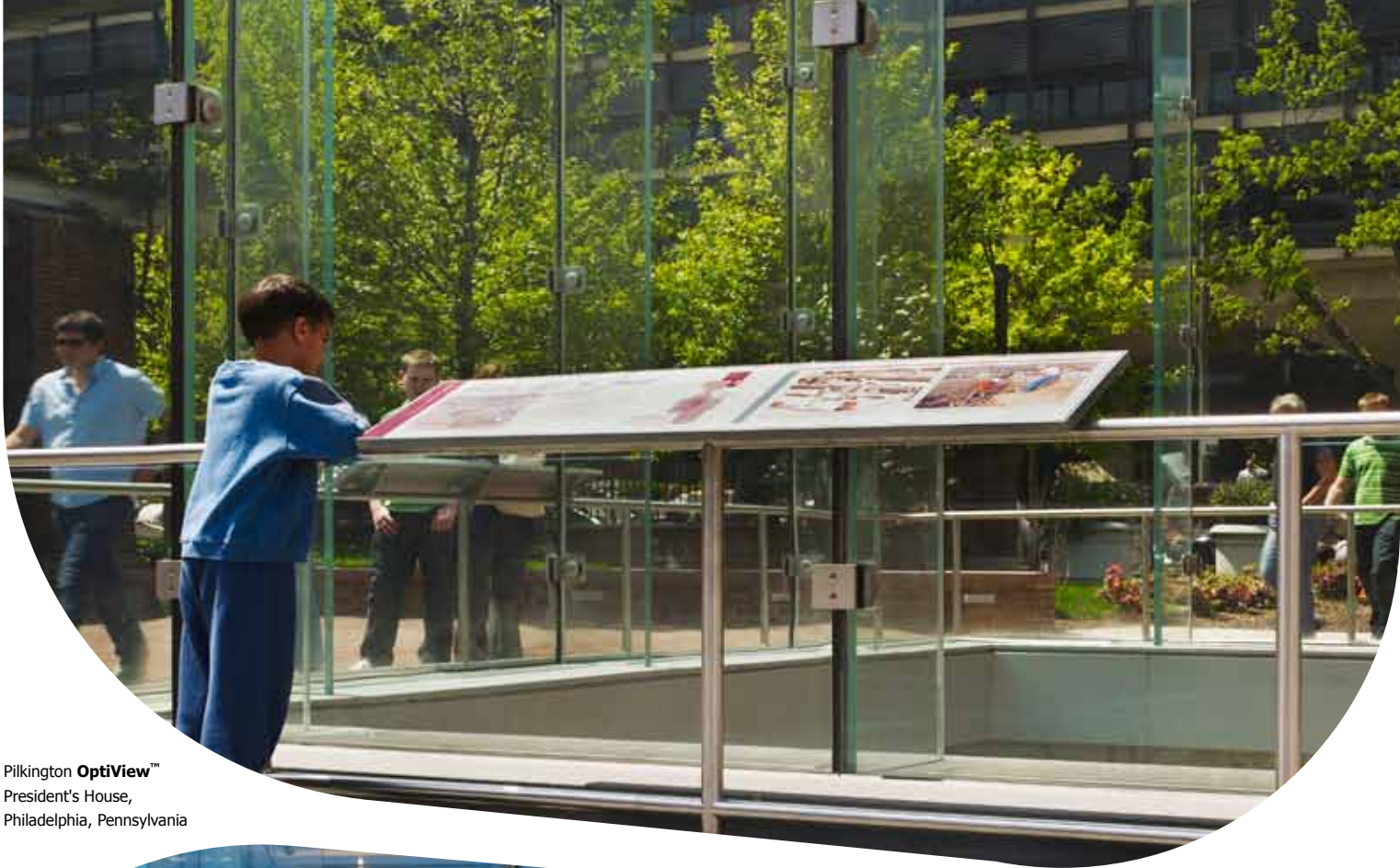
Pilkington OptiView™ President's House, Philadelphia, Pennsylvania