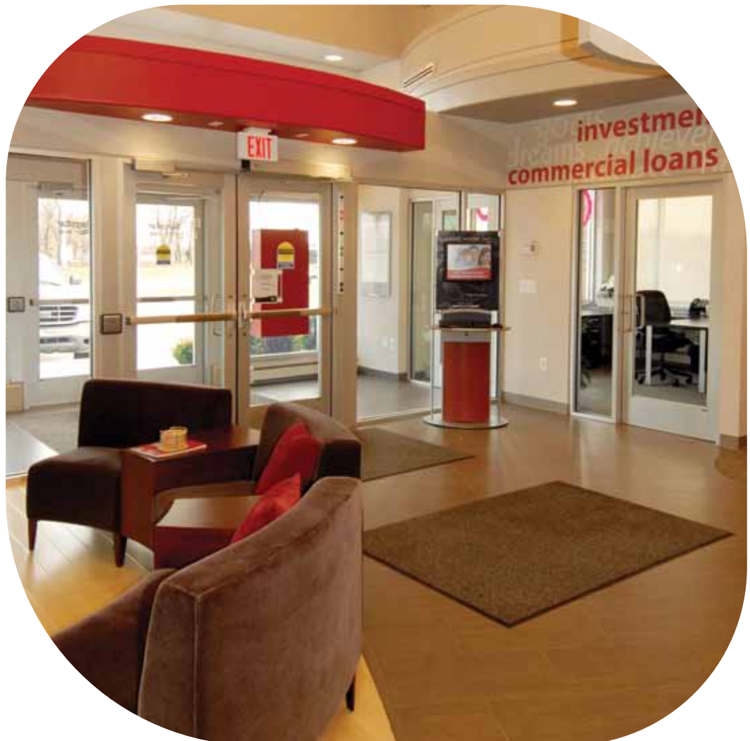
Pilkington OptiView™ Flagstar Bank, Michigan