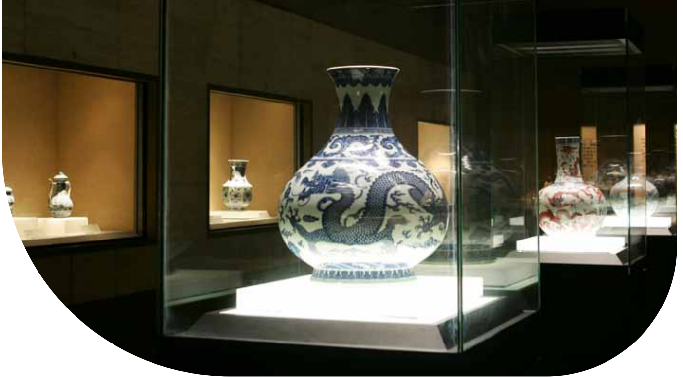
Pilkington OptiView™ Beijing Museum, China